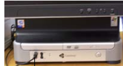
Computer to Speaker